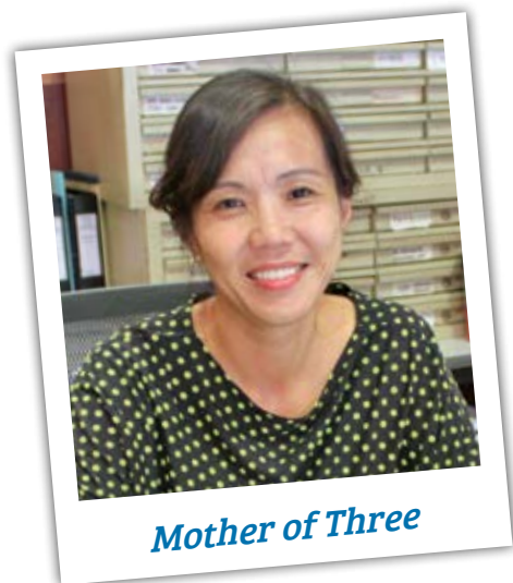
Mother of Three

Follow #PeopleOfNeeSoon on Facebook to read more stories of people around you.