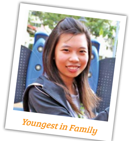
Youngest in Family