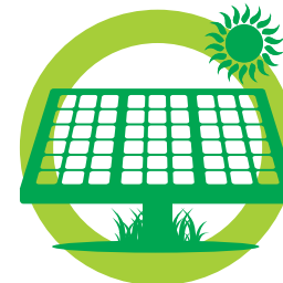
A Leading Green Economy