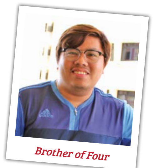
Brother of Four