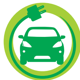
A Car-Lite Singapore