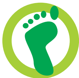
Eco-Smart Endearing Towns