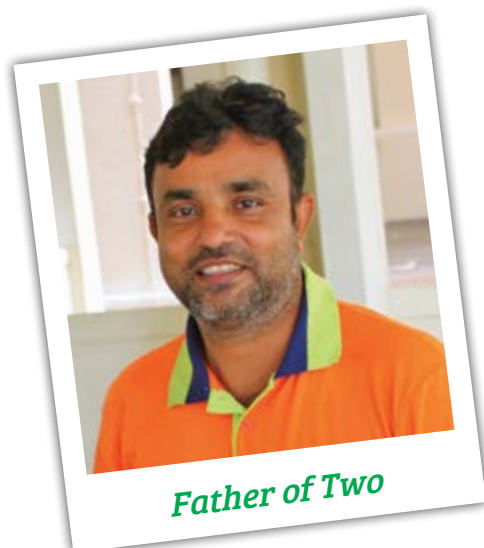
Father of Two

"Residents often share with me their cookings. We even celebrated Lunar New Year together! I like my job very much. I feel happy when I see dirt being washed away."