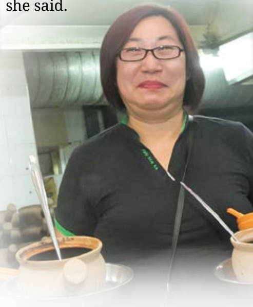
美食站 7 : 928 义顺叻沙 地址 : 大牌 928 义顺中 1 路 美食亮点: 叻沙