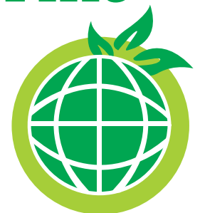
Towards A Zero Waste Nation